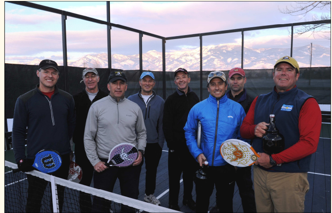
Men enjoying an evening of paddle:

This clinic will be a progressive lesson plan learning the fundamentals of the game. Open to all new players interested in paddle. Come out and find what the hype is all about!